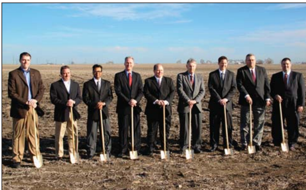
State, local and company officials, including Governor Dennis Daugaard, gathered for the Terex Bid-Well groundbreaking in Canton.