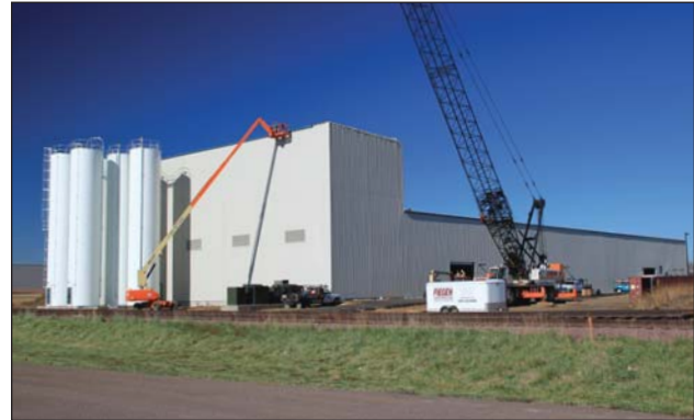
Construction is nearing completion at the Integra Plastics manufacturing facility in the Corson Development Park near Brandon.

In the Corson Development Park near Brandon, Integra Plastics had a different deciding factor in their decision to build a new plastics manufacturing operation there. The Madison, South Dakota-based company needed rail service for an economical supply of raw materials. The Corson park has grown specifically because it was developed as a rail park. The current construction of a new $400,000 runaround