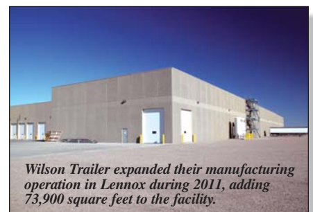
Wilson Trailer expanded their manufacturing operation in Lennox during 2011, adding 73,900 square feet to the facility.

Worthing, home to 1,000 people, experienced over $400,000 worth of construction in 2011, spread over 33 new projects. One new single-family home was built, while the city continues planning toward future residential, commercial and industrial growth. Planning for several quality of life projects has begun, including completion of a Master Parks Plan to guide the development of the Worthing Municipal Park, which will feature basketball and tennis courts and a walking trail. The LifeLight Music Festival continues to be a major economic benefit and regional attraction.