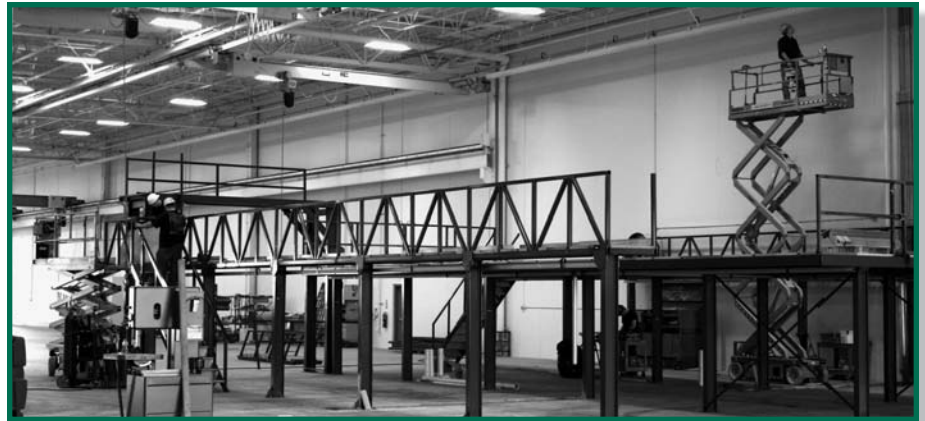
Wilson Trailer built a new trailer manufacturing facility in the Lennox Industrial Park.

Beresford experienced significant growth in 2008, including the sales of two lots in the 115 acre industrial park, resulting in the expansion and relocation of three businesses. Three new homes and six townhomes were built in 2008, and the city completed construction of a new recycling center and a bus barn to house the community transit program. Bouge, Inc. has announced plans to add 10,000 square feet to an existing building in the industrial park. Beresford, with a population of 2,190, issued 77 building permits valued at nearly $2 million in 2008.