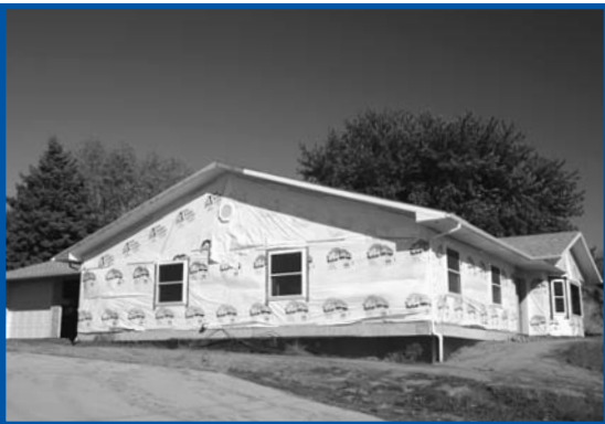
New homes, like this one in Baltic, continue to have a major economic impact.

Baltic, with a population of 975, saw new home construction in both the Baltic Heights and Valley View Meadows subdivisions; a total of seven new homes. In 2008, 55 building permits were issued at a valuation of nearly $1 million.