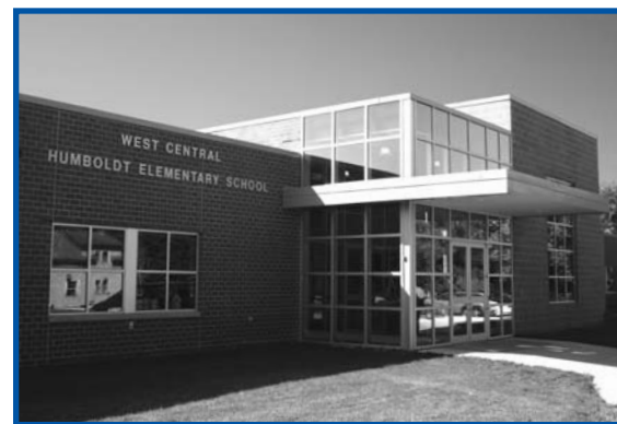
Educational infrastructure improvements include West Central's two new elementary schools, one in Hartford and this school in Humboldt.

Valley Springs saw the construction of two new single-family homes during 2008. The year saw 28 building permits being issued, with a valuation of $335,000 in this growing community of 825.