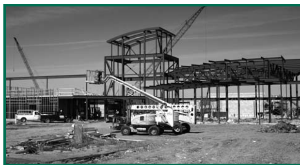
Education construction includes Harrisburg's new high school.