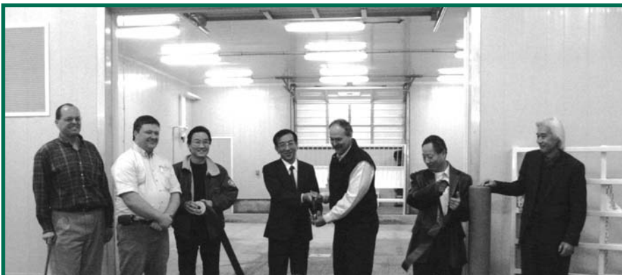
Bio-tech industry leader Hematech opened a new production facility in Hudson.

Tea grew again in 2008 to a population of 4,250 with both commercial and residential building activity. Dakota Millwork expanded this year by 19,600 square feet, while the local post office is expanding into a new 3,600 square foot building. The community is in the design phase for a new 25 acre park and athletic complex, and new businesses include Lewis Pharmacy, Straight Lines Quality Auto Restorations, B&G Milkyway and Daylight Donuts. The building permit total for 2008 was 140, with a valuation over $8 million, including 45 new single family homes.