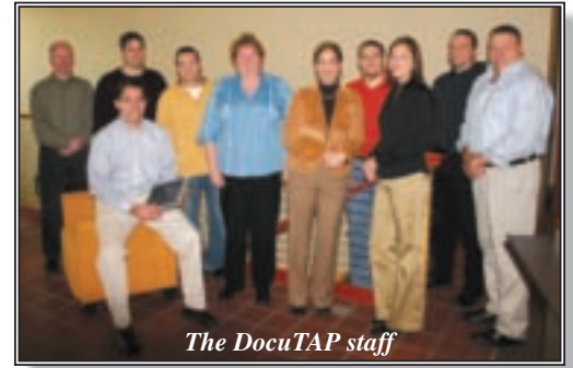
The DocuTAP staff