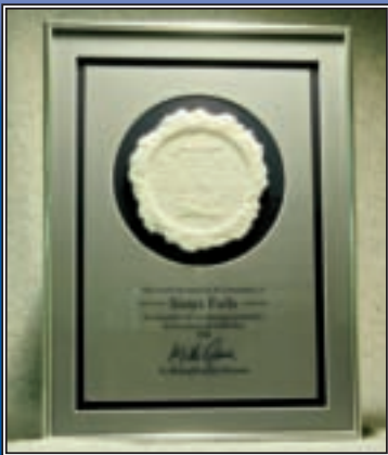
This is the third time that Sioux Falls has been named the Governor's Community of the Year. The award was also presented to the community in 1991 and 1994.