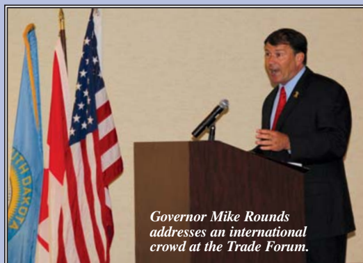
Governor Mike Rounds addresses an international crowd at the Trade Forum.