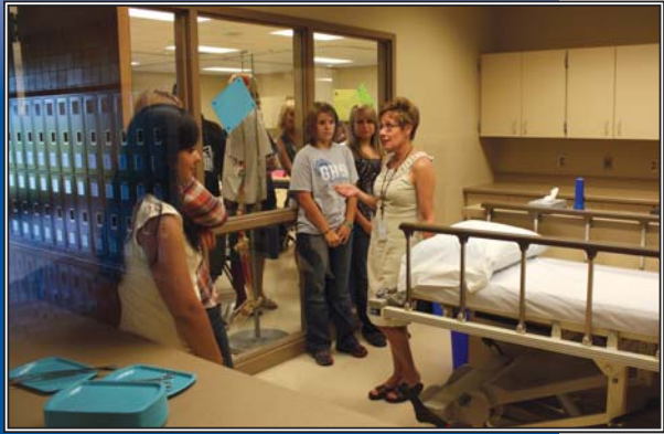
Health sciences students at the Career and Technical Education Academy view a practical classroom at the new school.